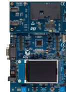
STM32G081B-EVAL STM32G0C1E-EV Evaluation boards

A full set of evaluation boards enables flexible prototyping as well as full STM32G0 evaluation.