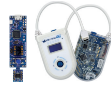
STM32G0316-DISCO / STM32G071B-DISCO (USB Type-C™) Discovery Kits